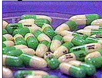
Many people choose Prozac over other antidepressants

An Environment Agency report suggests so many people are taking the drug nowadays it is building up in rivers and groundwater.